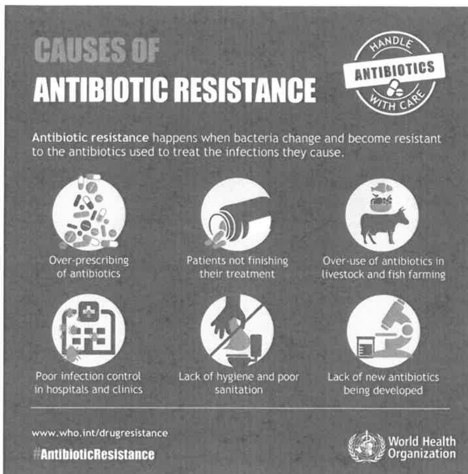
Figure 1. Causes of Antibiotic Resistance

Although drug resistance affects high-income and low-income countries alike, high income countries may be better equipped to respond to the AMR crisis, and thus feel less urgency about tackling the problem proactively. The greatest burden of AMR will be felt in low and middle-income countries, figure 2.